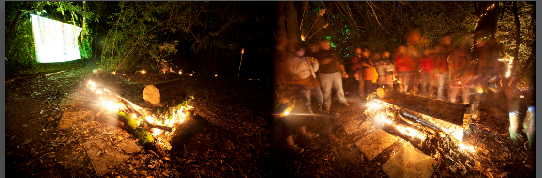
"Forest Floor" - End Of The Road Festival 2012